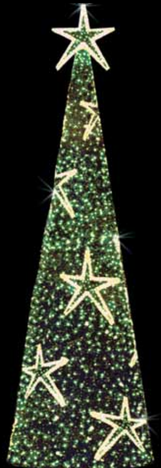
▲ Cone tree green with warm white LED star design Indoor/Outdoor use

6 m H X 1.7 m W GP02LCON600GRNWARMSC 9.2 m H X 2.7m W GP02LCON920GRNWARMSC