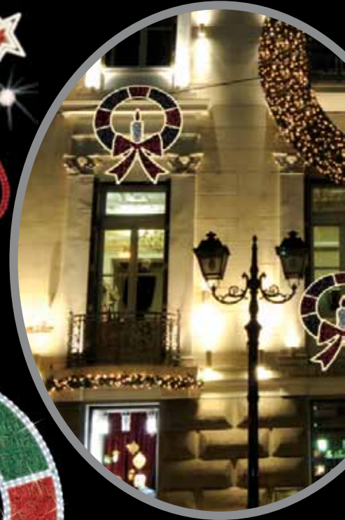
◀ Festive Wreath with bright white LED 1.4m H X 1.15m W GP03PODE140REGRWRCAN