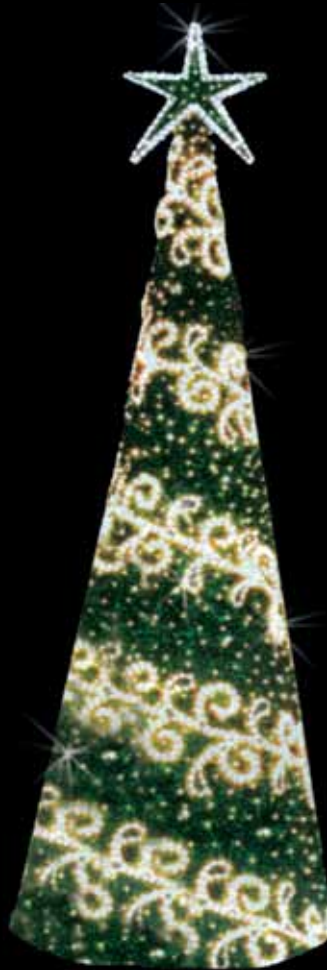
▲ Cone tree green with warm white LED scroll design Indoor/Outdoor use

5m H X 1.32m W GP02LCON500GRNWARMST 7.2m H X 2m W GP02LCON720GRREWARM 9.5m H X 2.7m W GP02LCON950GRREWARM