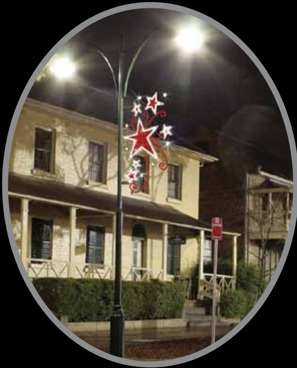
◀ Radiating Stars bright white and red LED 2.2m H X 1.20m W GP04PODE220REDPSTAR