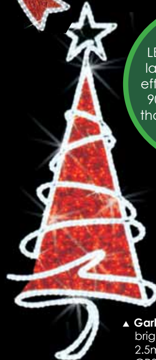
▲ Garland Tree with Star Top bright white LED 2.5m H X 1.10m W GP04PODE250REDTR

THINK GREEN! LED lighting is long lasting and energy efficient, consuming 90% less electricity than standard lights.