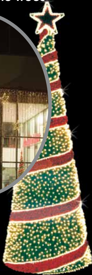
▲ Cone tree green with red stripe & warm white LED Indoor/Outdoor use

5m H X 1.32m W GP02LCON500GRNWARMST 7.2m H X 2m W GP02LCON720GRREWARM 9.5m H X 2.7m W GP02LCON950GRREWARM