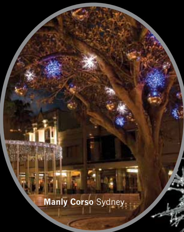
Manly Corso Sydney

▼ Branch tree warm white LED 3.9m H X 2.1m W GP02LBRT390WARM 5.7m H X 3.6m W GP02LBRT570WARM 7.3m H X 4.8m W GP02LBRT730WARM