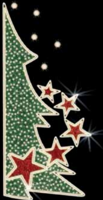
▲ Starry Tree with bright white LED 2.5m H X 1.5m W GP04PODEC250REGOTRSTR