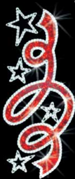
▲ Ribbon & Stars with bright white LED 2.5m H X 1.10m W GP04PODE250REWHSPIR