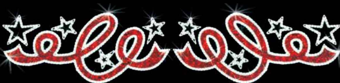
◀ Ribbon with bright white LED stars and outline 1.10m H X 5m W GP04SDEC500REWHRIB