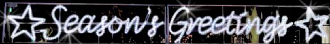
◀ Seasons greetings bright white LED 70cm H X 5.5m W GP04LESI550WHTESG